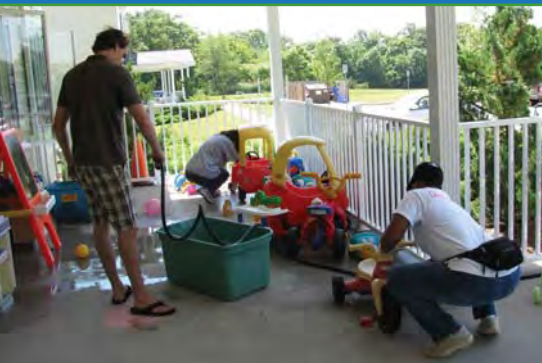
Ethicon volunteers sprucing up the "vehicle fleet" at the Center.

Be a Facebook Friend. Join the Center on Facebook, “friend” us, and ask your friends to do the same. If you don’t have an account, click on the link on the Center’s website to see recently updated pictures and happenings here.