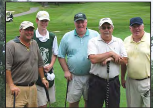
A very hot, but happy group.