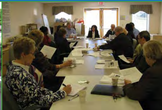
The Board of Directors of the Center discussing future plans.