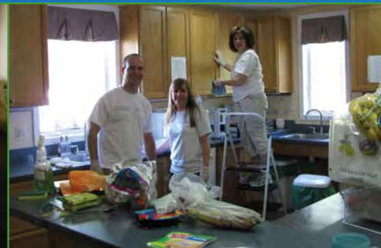
Members of a large group from Ethicon cleaning the kitchen in one of the houses.